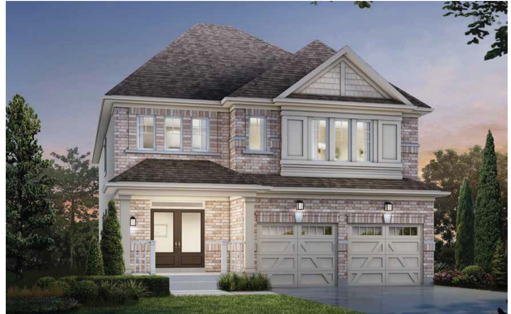
ELEVATION B - 2935 SQ FT