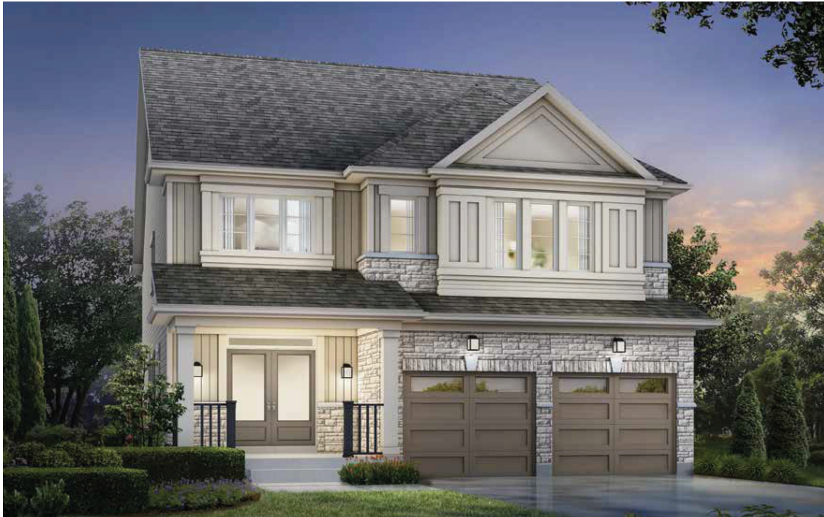
ELEVATION A - 2938 SQ FT