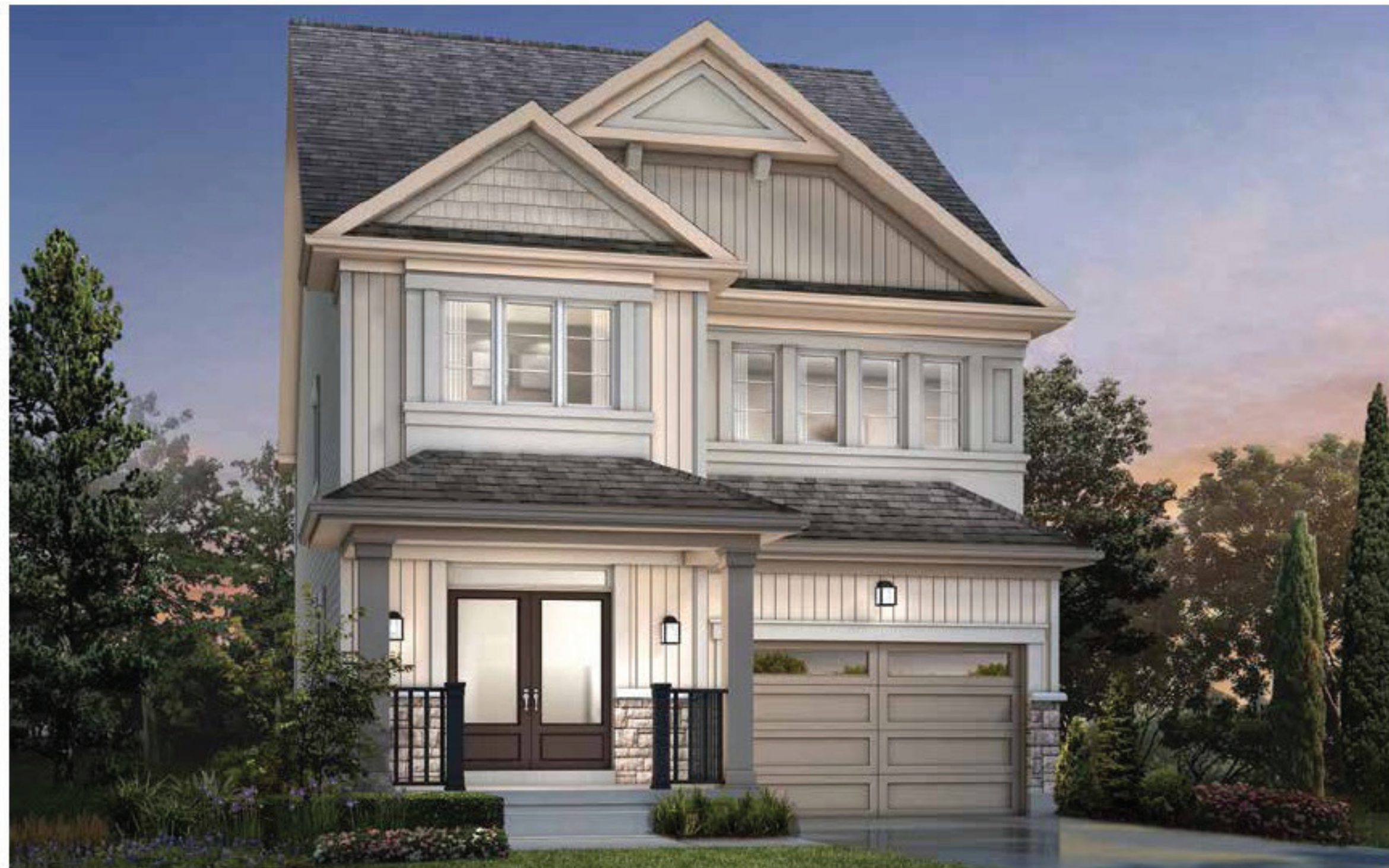
ELEVATION A - 2087 SQ FT