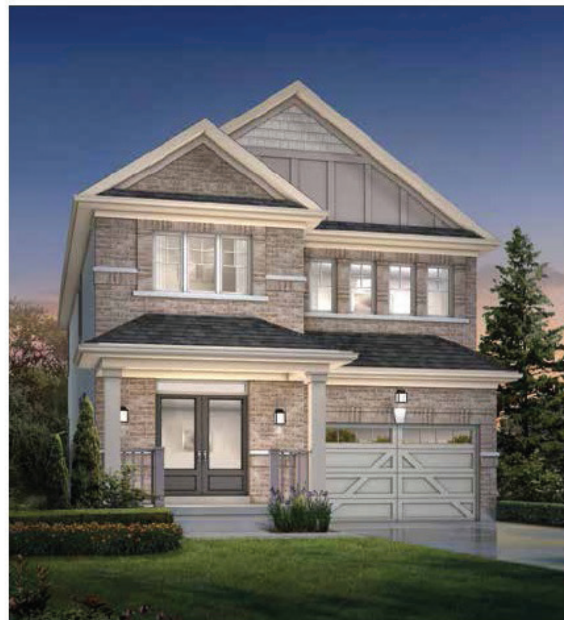
ELEVATION B - 2090 SQ FT