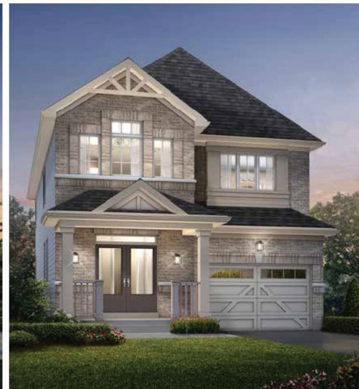
ELEVATION C - 2097 SQ FT