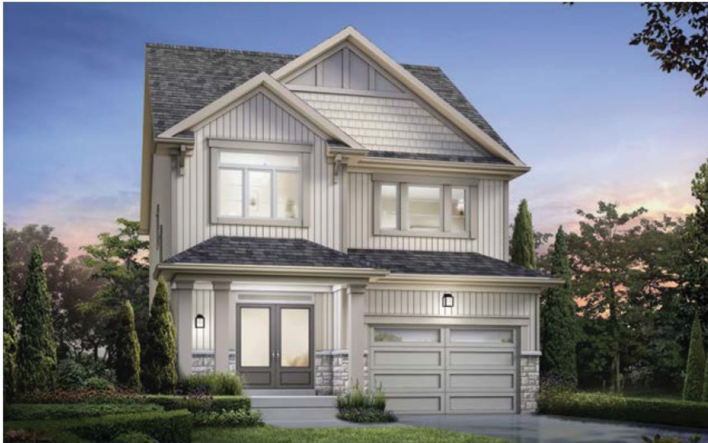
ELEVATION A - 1830 SQ FT