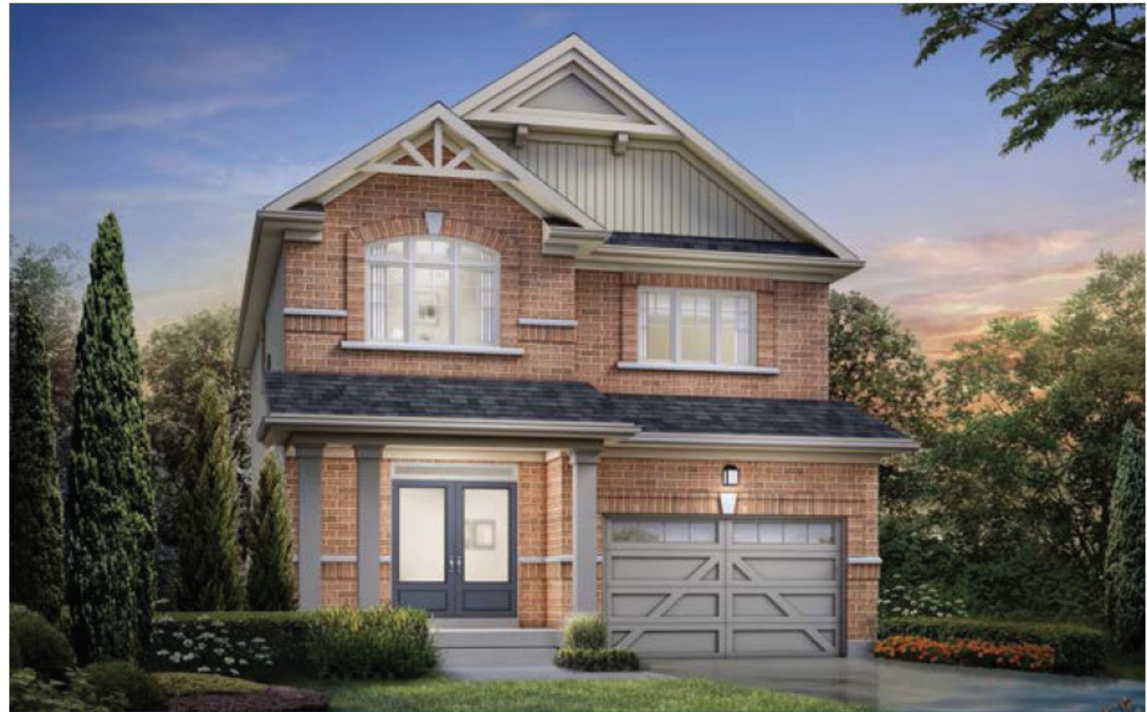
ELEVATION B - 1838 SQ FT