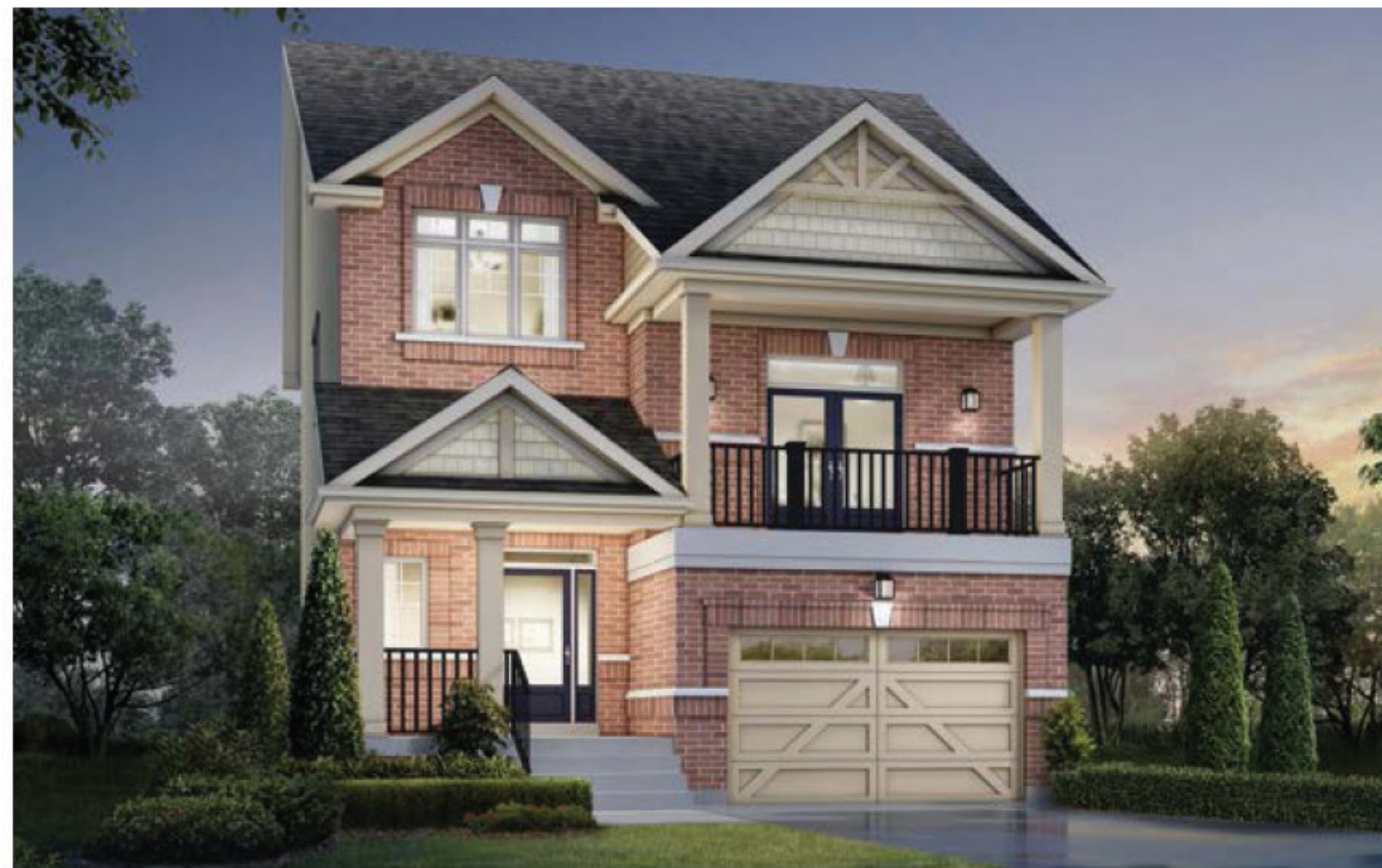
ELEVATION B - 2138 SQ FT