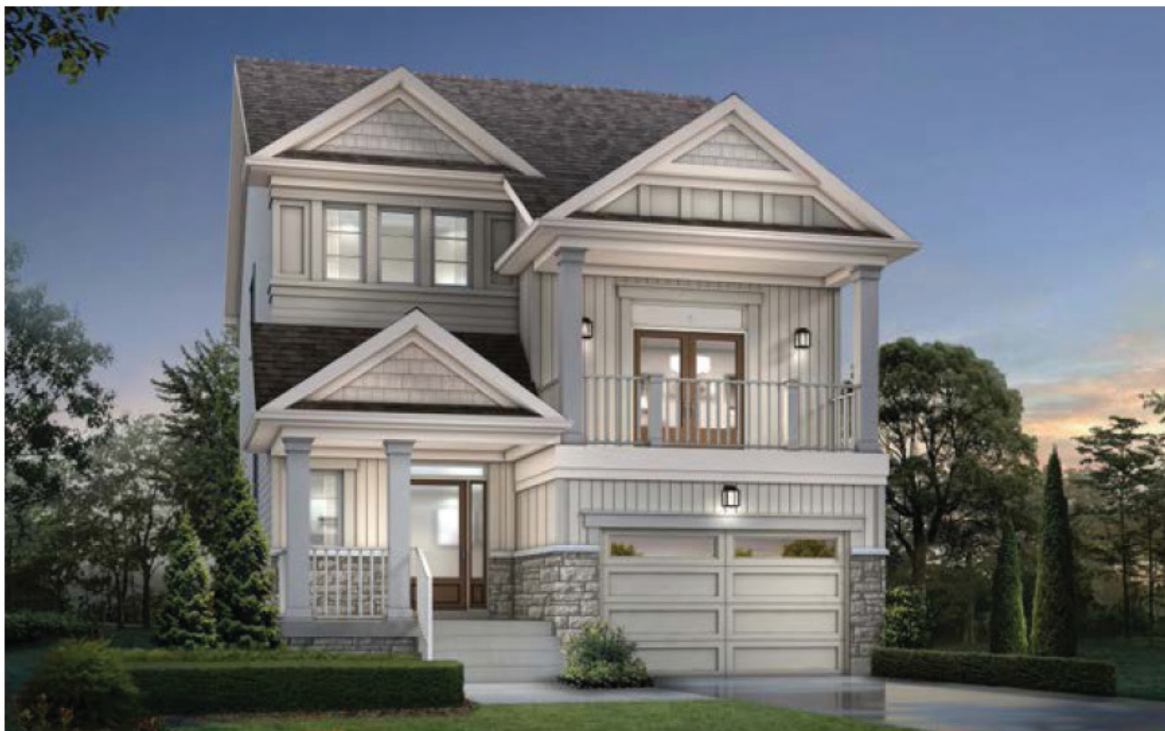
ELEVATION A - 2121 SQ FT