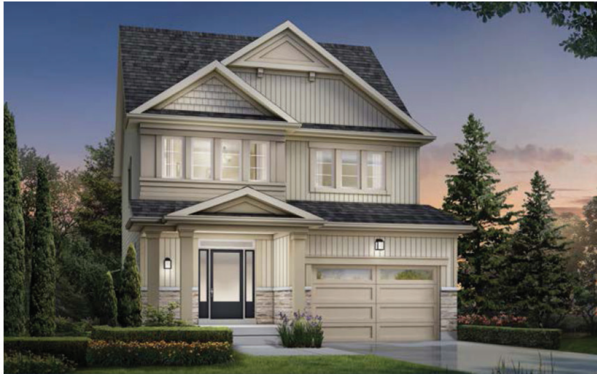
ELEVATION A - 1539 SQ FT