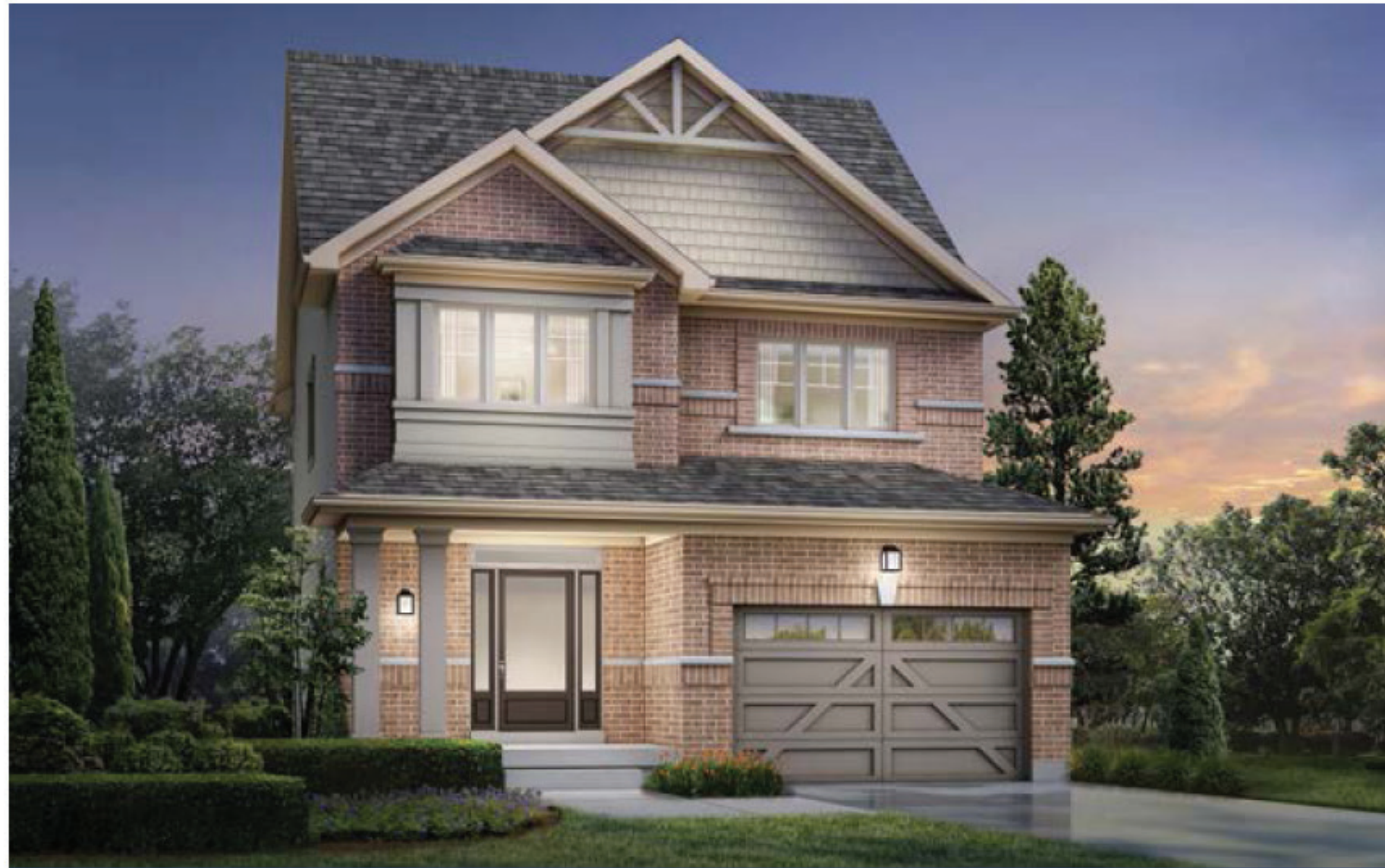
ELEVATION B - 1529 SQ FT